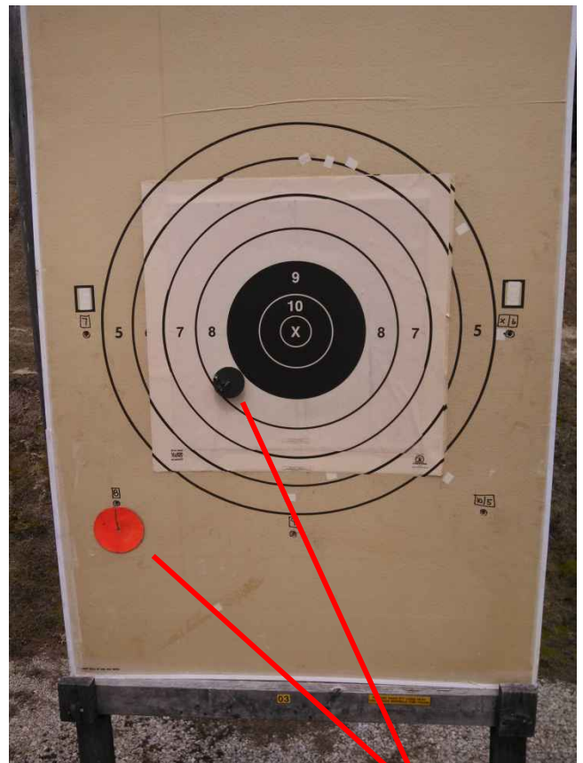
Shot Value is an 8