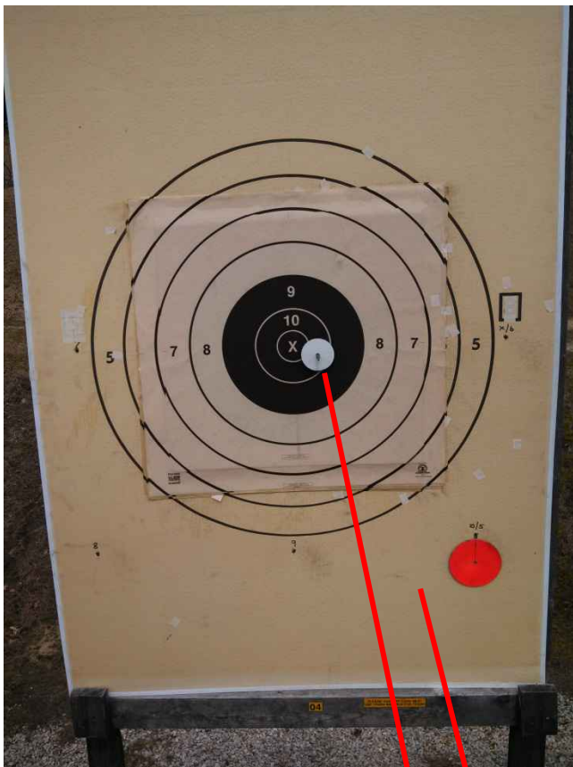
Shot Value is a 10